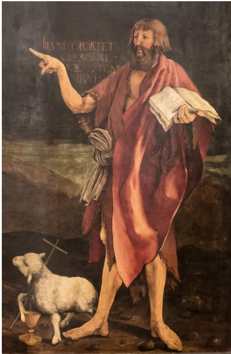
John the Baptist Pointing to Jesus (From the Isenheim Altarpiece)