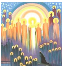
Photo Credit: 'By E. Wang, © Radiant Light' – T-00042A-OL All Saints . Used with permission of Radiant Light.

Allan Hugh Cole offers a plan of "good mourning" --a way to work through the loss and rebuild life with new strength. Cole describes what it takes to be engaged in good mourning instead of endless suffering and demonstrates how faith and prayer can be practical tools in rebuilding life after loss.