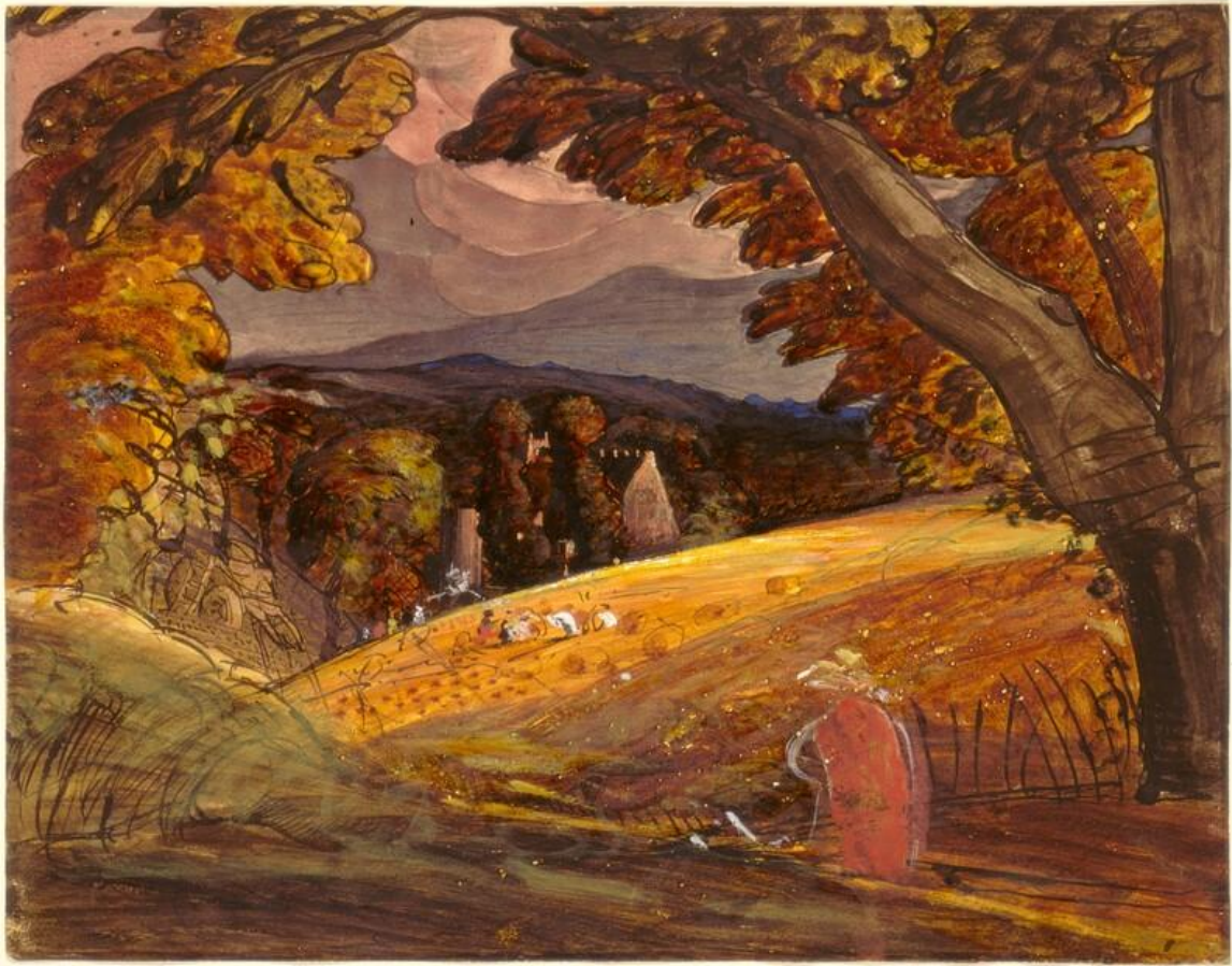
“Harvesters by Firelight” Samuel Palmer, 1830