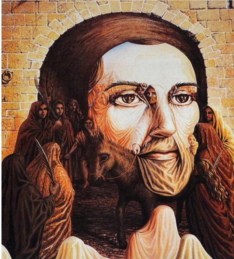
Hidden Image Art by Octavio Ocampo