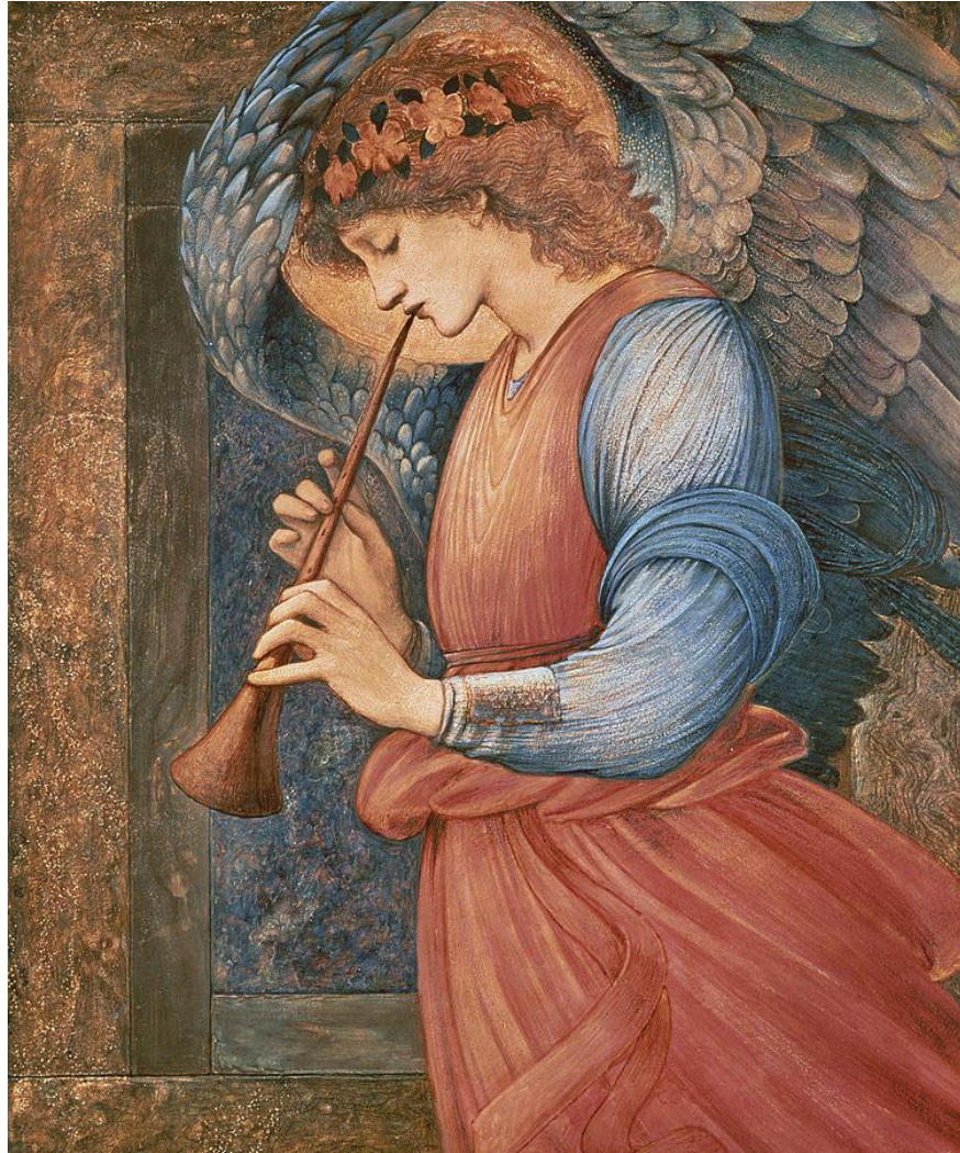
An Angel Playing a Flageolet Sir Edward Burne-Jones (1878)