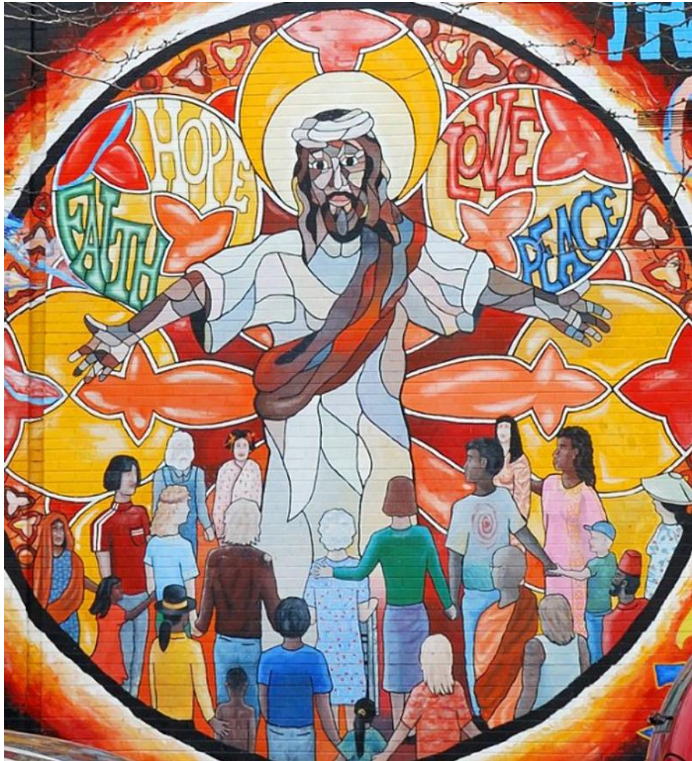
Jesus Mural: Faith, Hope, Love, and Peace Chicago